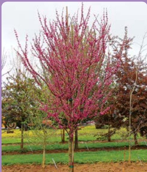
Cercis canadensis 'Pink Trim' Northern Herald® Redbud

Narrower in form and reputed to be more heat tolerant than Bloodgood, its foliage maintains its rich color through the heat of summer before turning bright scarlet red in autumn. Late to leaf out in spring, it's a good choice where late frosts may damage tender spring foliage.