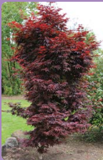
Acer palmatum 'Twombly's Red Sentinel' Twombly's Red Sentinel Japanese Maple