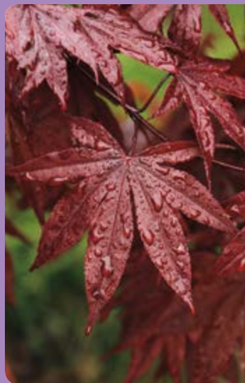
Acer palmatum 'Emperor I' Emperor I Japanese Maple

Columnar form of this vigorous and unusual sport of Bloodgood makes it a fine choice for containers, courtyards and small spaces. Spring foliage emerges bright red and darkens to burgundy in summer. Attractive bark and twigs are dark red and add winter interest.