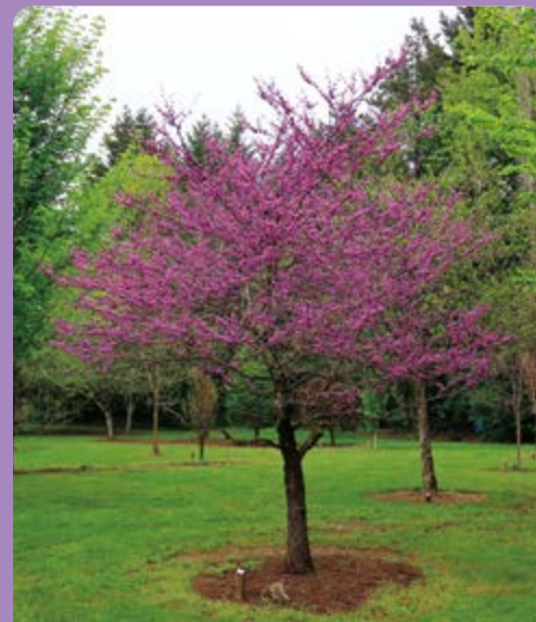
Cercis canadensis 'Morton' Joy's Pride™ Redbud

Pink buds unfurl to large, white, multi-petaled blooms that are followed by clean, dark green, heat tolerant leaves. Tested and introduced by NDSU, this pest free, pH adaptable, winter hardy selection blooms reliably even after early spring frosts and winter lows of -35 °F.