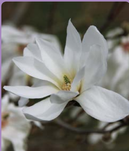
Magnolia x loebneri 'Ruth' P.A.F. Spring Welcome® Magnolia

This extremely cold hardy selection discovered in central South Dakota brings bright pink blooms to prairie and mountain landscapes. Introduced by North Dakota State University, its dark green, leathery leaves are heat resistant and wind tolerant.